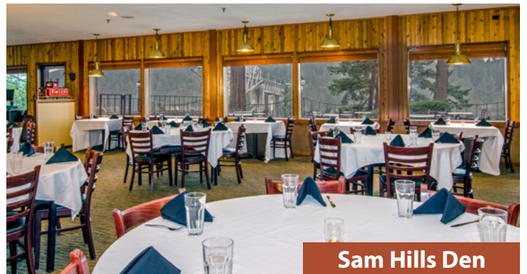
Sam Hills Den